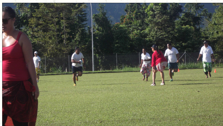
Yellow and Red team competing for which will be getting third and fourth place in Soccer while Blue playing against Green in the finals.